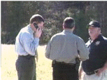
Agents searched a wooded area of Appling County between Jesup and Alma this morning.