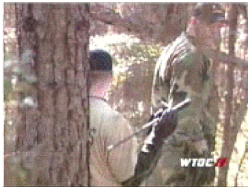
The search ended today with the discovery of the three-year-old's body.